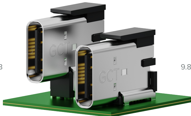
USB4205 9.89mm profile above PCB